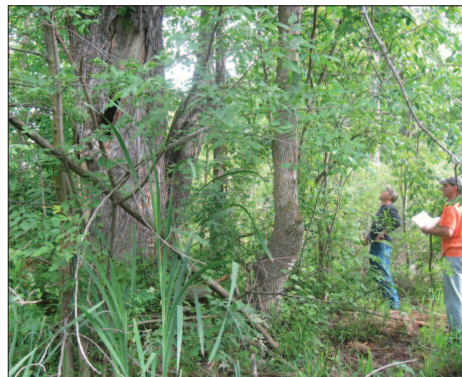
Old growth Maple tree