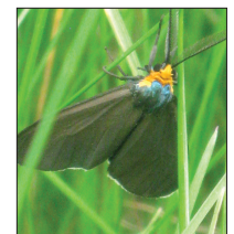
Virginia Ctenucha Moth