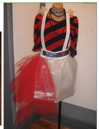
Recycled Fashion - The Bubble Wrap Dress. Made by a creative young fashion designer