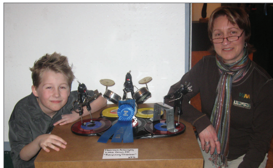
Youth 1st place winner "Recycling Chamber" Music Group

Here are just a few of the fun pieces that were submitted to the contest.