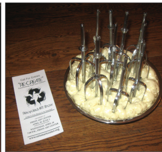
Adult Household Category "Social Mixer"