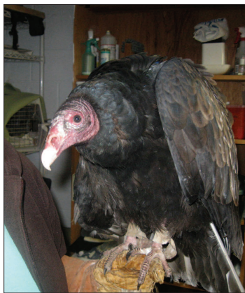
Meet a fully recovered Eva Orion, 10 days after her rescue. She was very comfortable in her new surroundings. She is now an educational bird with Braveheart Raptor Center in Western Michigan.

Eva Orion is a Turkey Vulture rescued on Christmas Eve at Eagle Valley in 2008. She'd been discovered with an injury to her wing which was not repairable. After a brief stay at the River Raisin Raptor Center in Manchester, she now lives at Braveheart Raptor Center, north of Muskegon and serves as an educational bird...teaching young people about the importance of our wildlife and the role that each creature serves in our environment.