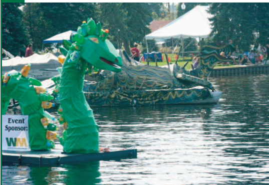
"Dragon on the Lake-Ness Monster"

The Dragon Boat Races allowed teams of rowers to raise money for their favorite charities. It was a great community event and much fun was had by all...even the losing dragon boat racers!