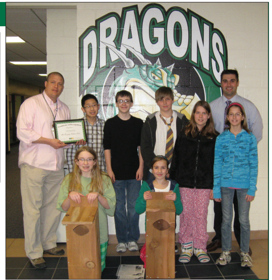
Walden Middle School students

This Wildlife at Work program gives WM's employees and its visitors an opportunity to learn more about the importance of connecting to nature.