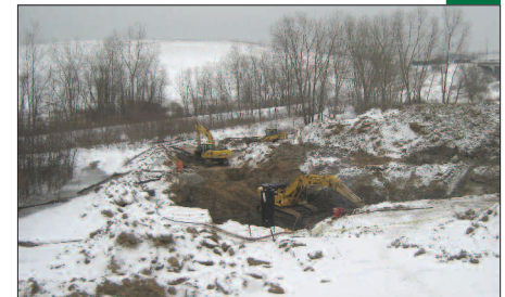
Gas plant installation

By the summer of 2011, additional landfill gas being generated by the waste as it decomposes at Eagle Valley will begin to create power for DTE. The 5,500 sq ft building will be a 2 engine plant, with 3520 Caterpillar engines with 20 cylinders each, generating enough energy to power the equivalent of about 3,000 homes.