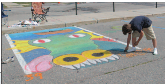
Chalk art contest