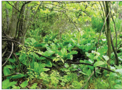
Wildlife habitat at Eagle Valley Landfill

Also in 2010, Eagle Valley received its Wildlife Habitat Certification from the Wildlife Habitat Council for its Wildlife at Work Program. The program has successfully engaged WM employees and local community groups in wildlife observation and conservation. The facility now provides habitats designed to encourage wood duck populations that are in decline, as well as habitats for bats. Bats are important for controlling the mosquito population, a single bat can eat up to 1,000 mosquitoes in an hour.