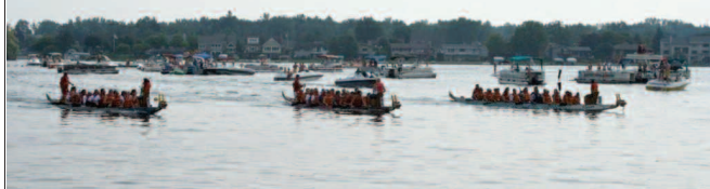
Dragon Boat Races