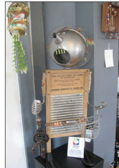
Some Catch! Please don't litter!