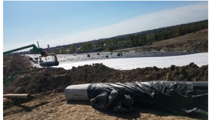
Cell 12 Overlay Liner to Cell 1 - Looking to the southwest

In 2019, Waste Management completed another overlay liner between the newer Cell 12 and the old Cell 1 at Eagle Valley. Residents in the area may have seen this work taking place on their drives on Silver Bell Rd. This overlay liner system ensures that leachate (liquid and precipitation that collects in Cell 12) will be managed separately from Cell 1.